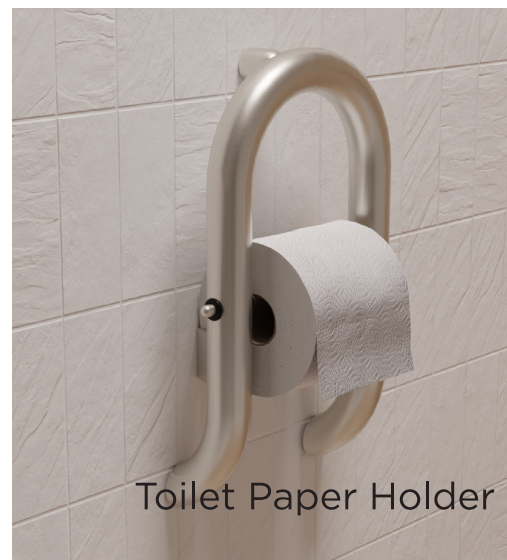
Toilet Paper Holder